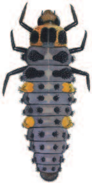
Seven-spot Ladybird larvae Coccinella 7-punctata (11 mm)