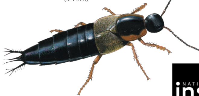
Rove Beetle Philonthus marginatus (22 mm)

Ground Beetles (Family Carabidae) and Rove Beetles (Staphylinidae) are predators. They hunt for slugs and other small invertebrates. You may find them among the grass under pots and stones.