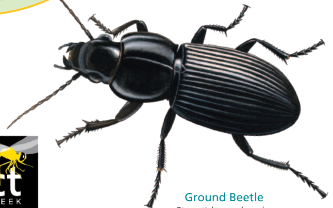
Ground Beetle Pterostichus melanarius (30 mm)