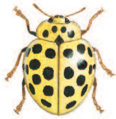
Twentytwo-spot Ladybird Thea 22-punctata (5 mm)