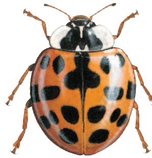
Harlequin Ladybird Harmonia axyridis (8 mm)